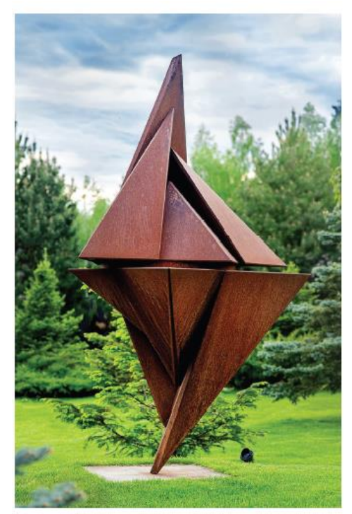
Supported by Howarth Foundation Represented in Ukraine by Abramovych Art Agency