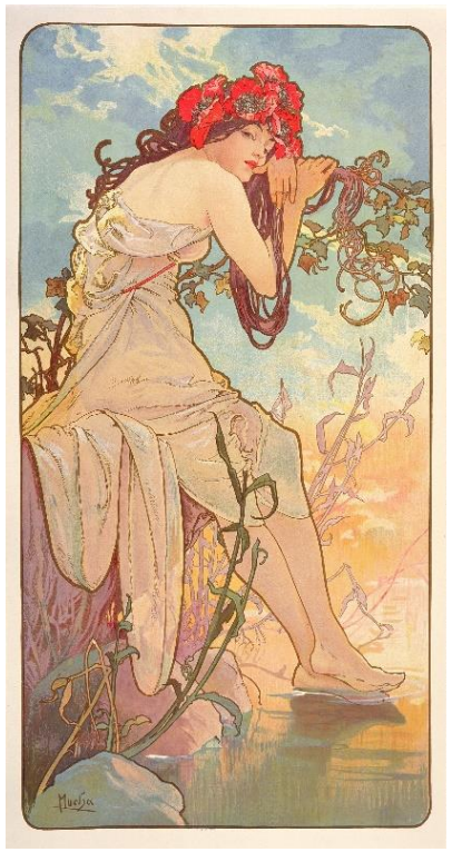
Alphonse Mucha The Seasons: Summer 1896, colour lithograph, 103 x 54 cm © Mucha Trust 2024

The Art Gallery of NSW releases first major program announcement for this year